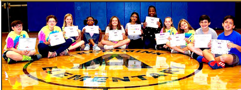
Fifth Grade Summer Scholars and our Students of the Month for Library, Art, Music and Physical Education